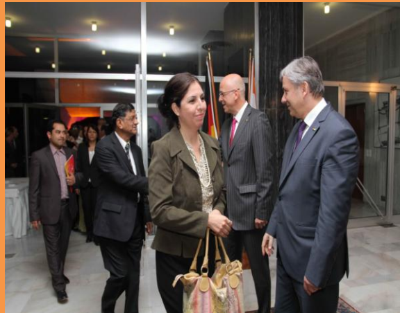
The Evening before the inauguration, Berlin Mayor Klaus Wowereit and Delhi and Germany's acting Ambassador to India Cord Meier-Klodt Welcomed the sponsors of the Buddy Bear exhibition in New Delhi.