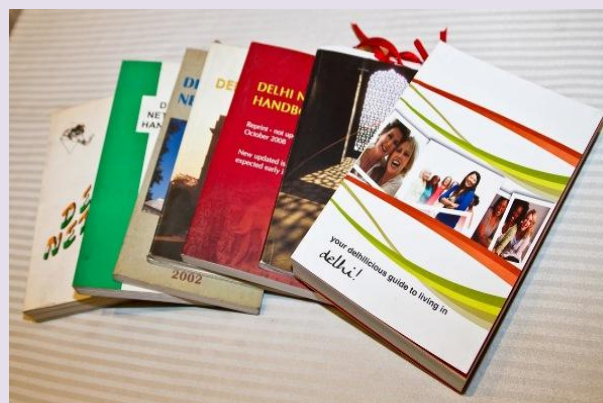
The many editions of the DN book