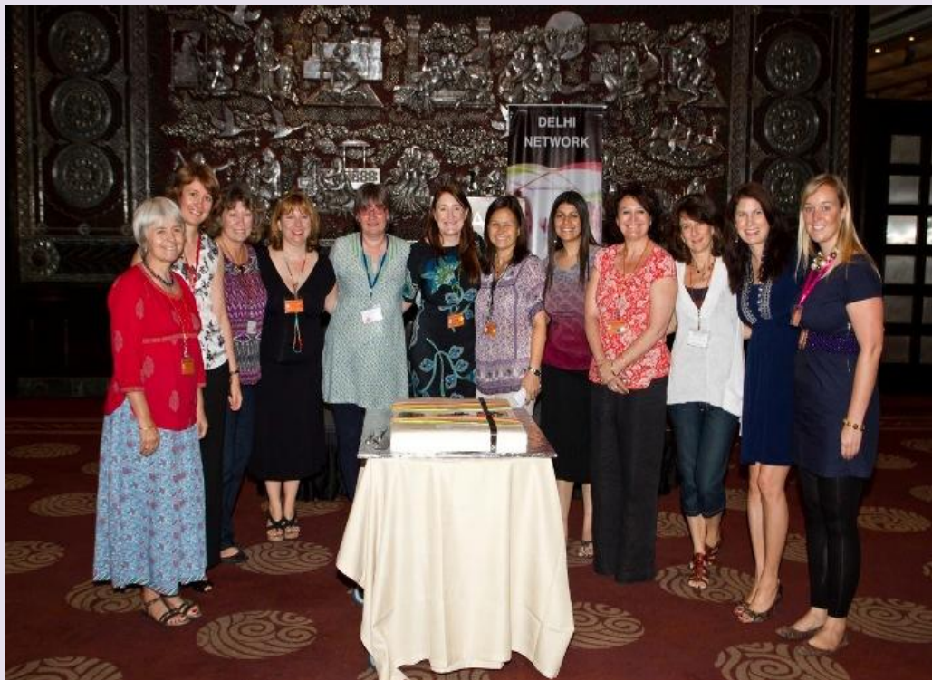
The DN committee