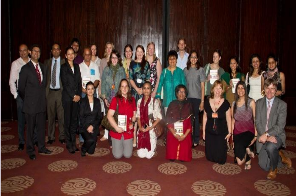
Group picture of the many contributors and sponsors of the DN book